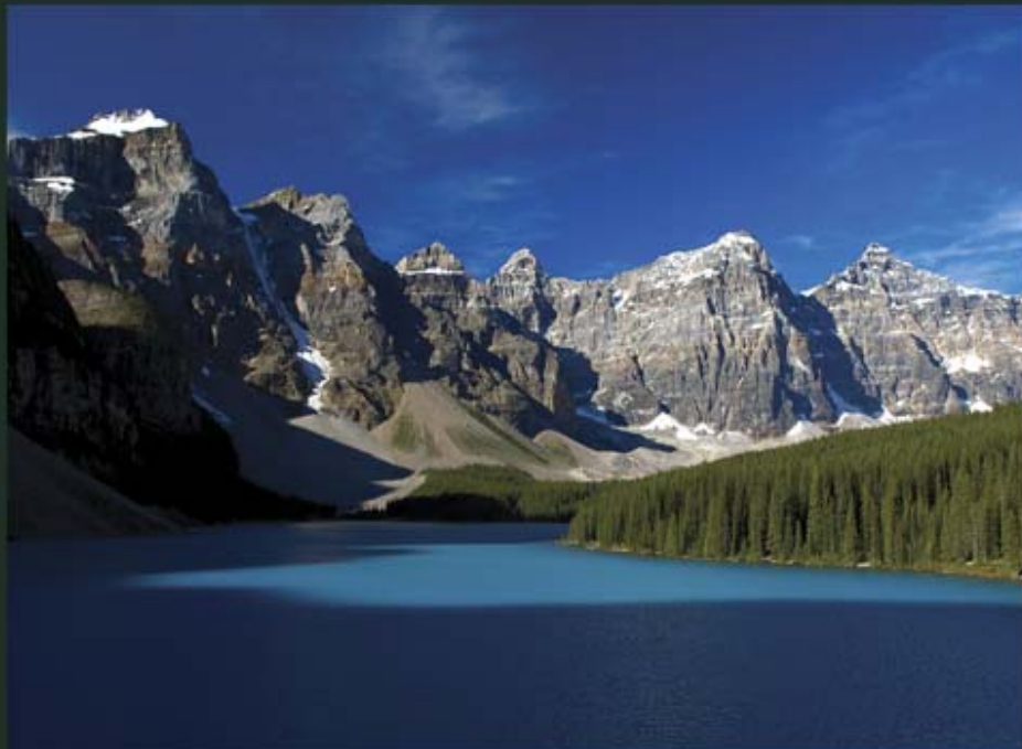
Shades of Blue: Light and Dark in the Canadian Rockies