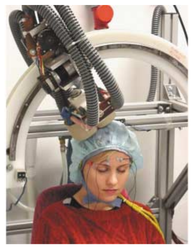
<sup>a</sup> Most investigators perform TMS with the operator holding the coil flat over the target brain region. In this illustration, the coil is mounted and the electrodes are in place to allow continuous EEG monitoring. Mounted coils and head supports might play a role in future strategies for anatomically precise stimulation.

FIGURE 2. A Subject Undergoing Transcranial Magnetic Stimulation (TMS)<sup>a</sup>