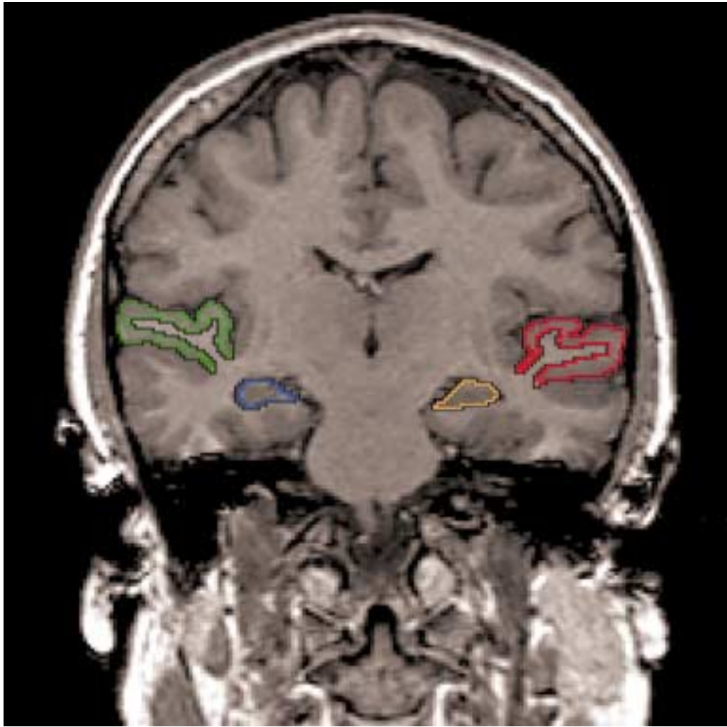
FIGURE 1. Delineation of the Posterior Superior Temporal Gyrus and Amygdala-Hippocampal Complex Regions of Interest in a Coronal Brain Slice a

a The gray matter of the superior temporal gyrus is labeled red on the subject's left and green on the subject's right. The gray matter of the amygdala-hippocampal complex is orange on the subject's left and blue on the subject's right.