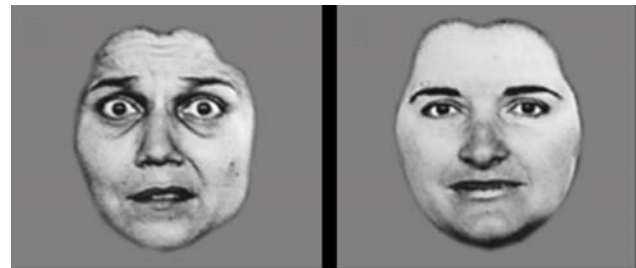
FIGURE 2. Example of Fearful and Neutral Faces Used in the fMRI Paradigm

analyses: those with conduct problems and elevated levels of callous-unemotional traits (N=17) and age- and IQ-matched (full-scale IQ) comparison subjects (N=13). The grouping procedure is described in Figure 1, and the groups' basic characteristics are summarized in Table 1.