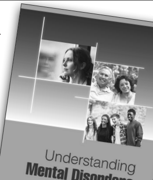
Mental Disorders Your Guide to DSM-5®

Most of us know someone who suffers from a mental illness. This book helps those who may be struggling with mental health problems, as well as those who want to help others achieve mental health and well-being.